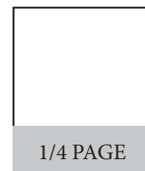
180mm (w) x 60mm (h)

For more information or to place an advertisement please contact: