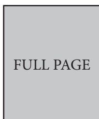
210mm (w) x 297mm (h) with 5mm bleed